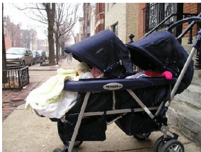
Traveling in the snow