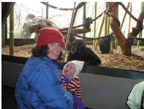
At the zoo