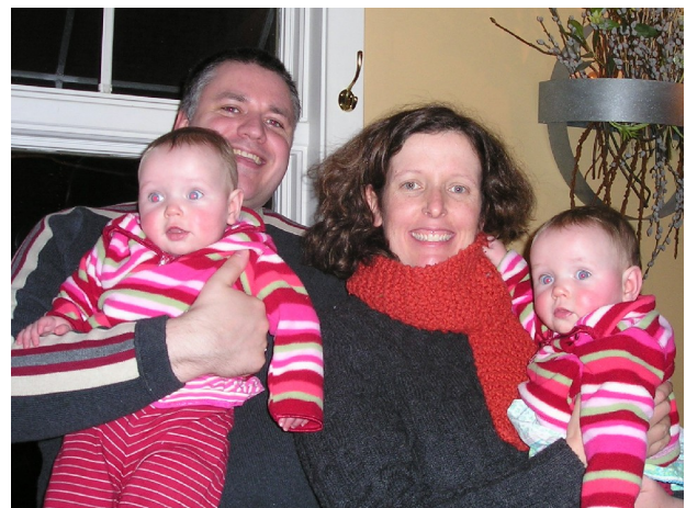
Mom and Dad out on the town with the twins